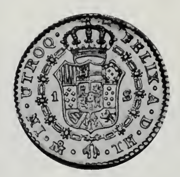
Lot No. 2383